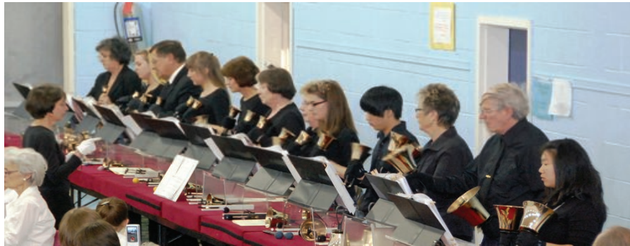
Handbell ringers from First UMC play during the Handbell Festival in Sayville, March 7.